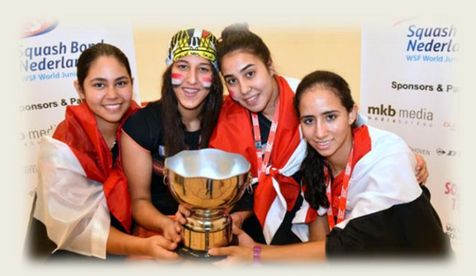
Team title Holders Egypt.

The 17th biennial World Squash Federation Championship will take place at Devoy Squash & Fitness Centre in Tauranga, the fifth largest city in New Zealand, from 25-29 July - following the Men's & Women's World Junior Individual Championships, which will be held from 19-24 July.